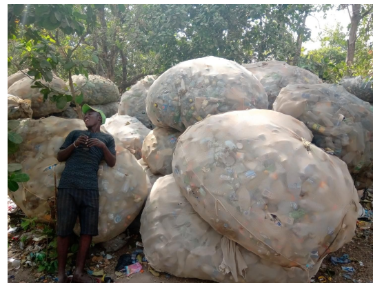
Plastic materials sorted and compressed, ready to be repurposed

Note: Information is subject to change according to local conditions.